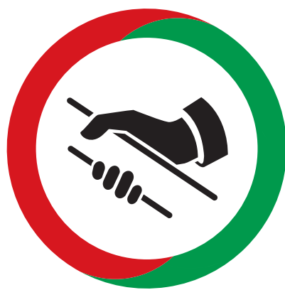
STAIRS / ESCALATOR